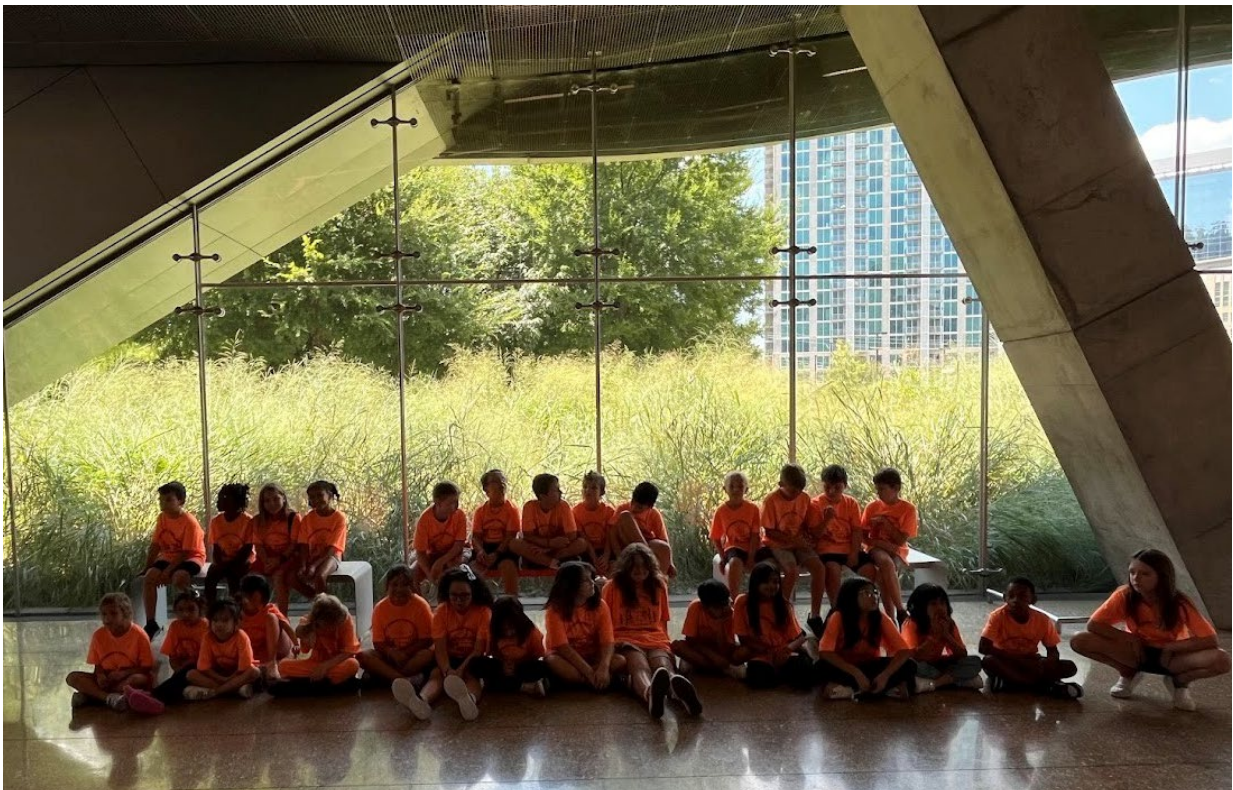
07-10-24 Camp Watauga Perot Museum field trip