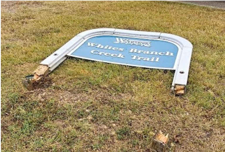
Whites Branch Creek Trail graffiti & vandalism