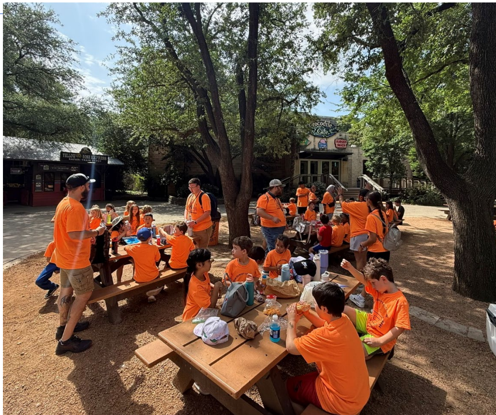
Camp Watauga Fort Worth Zoo field trip 06/18/25