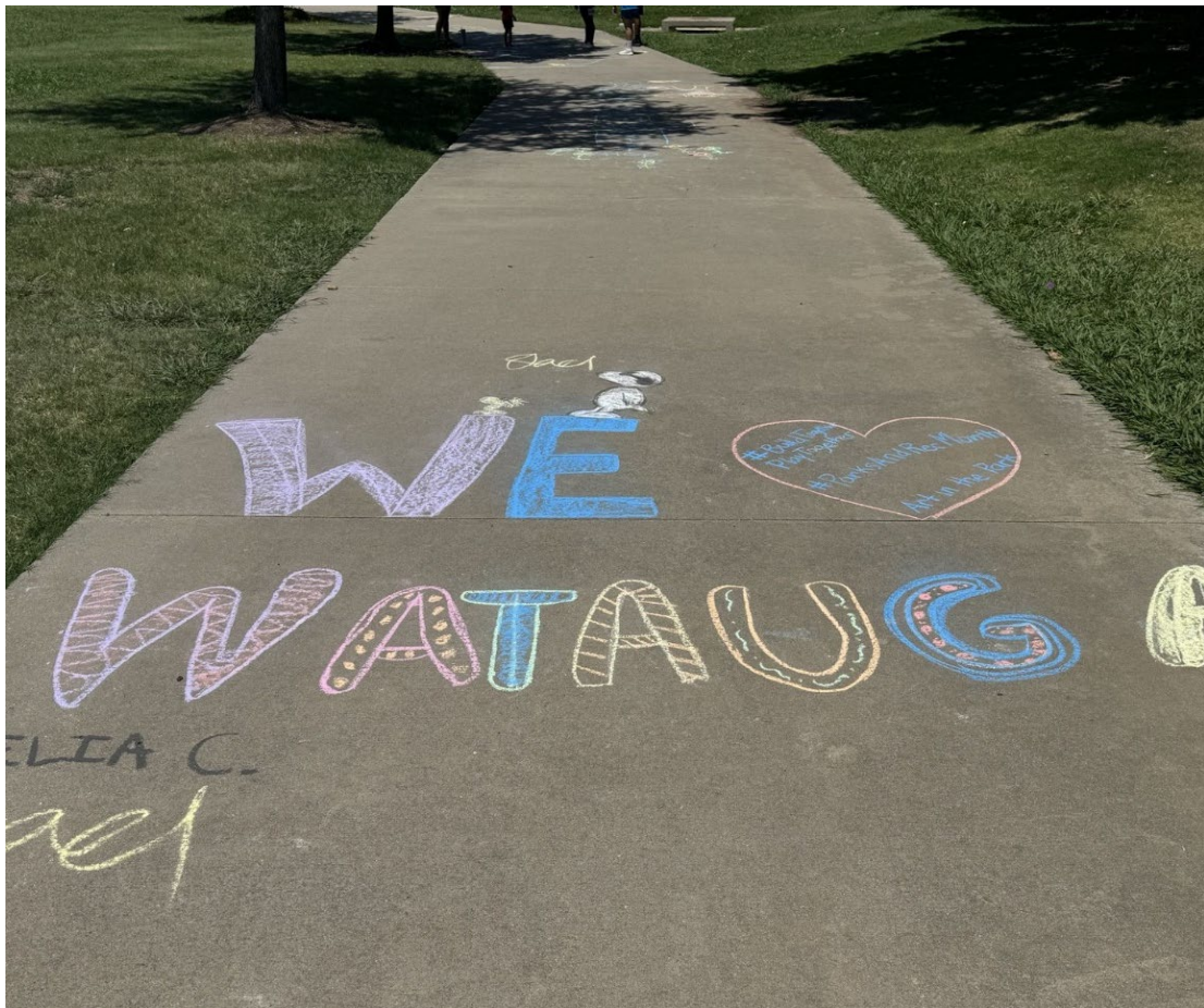
07/22/25 - Art in the Park @ Capp Smith Park, part of Parks & Recreation Month