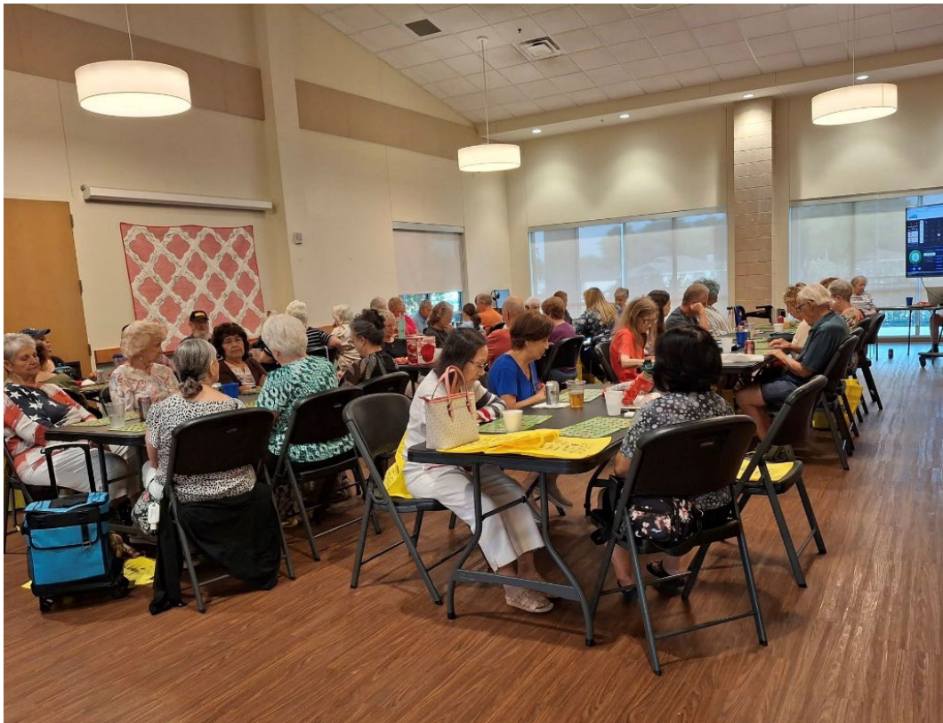
08/26/25 – Bingo Bash @ the Active Adult Center