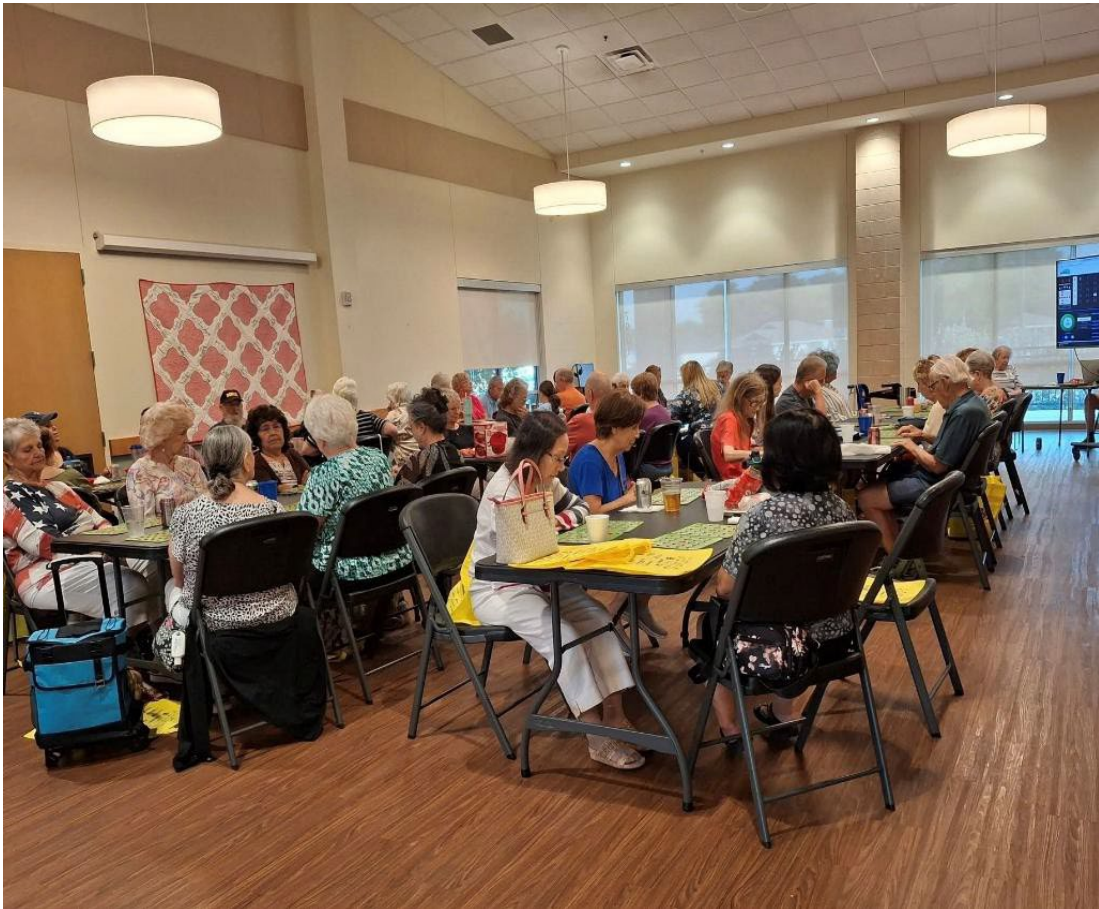
09/10/25 – Thrivent Financial Advisors Lunch & Learn @ the Active Adult Center